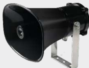
JREX-HSA-A Explosion Proof Horn