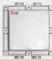
JR-EJB-01 Explosion Proof Junction Box