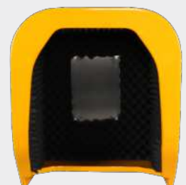
JR-TH-01 Acoustic hood