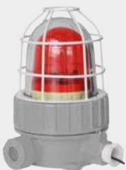
JR-EB-01 Explosion Proof Beacon