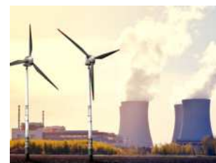
Nuclear power plant