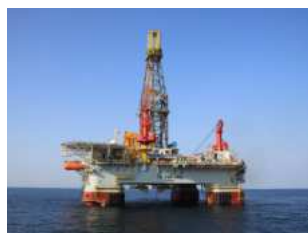
Offshore drilling platform