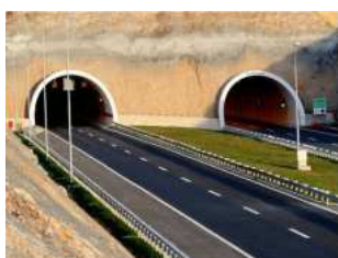
Highway / Tunnel