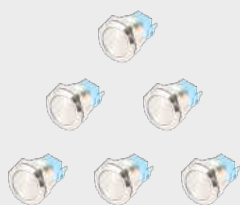
Button Multiple Options Available