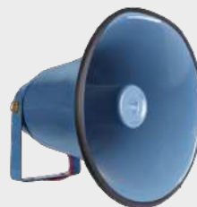
JR-HSA-10/20/25/30/35 Broadcast Horn