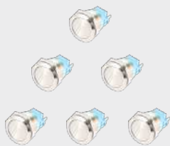
Button Multiple Options Available