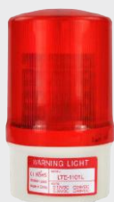
JR-LP-02 LED Beacon Light