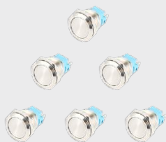
Button Multiple Options Available