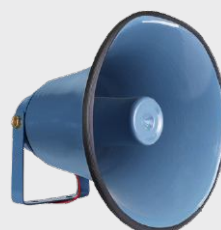
JR-HSA-10/20/25/30/35 Broadcast Horn