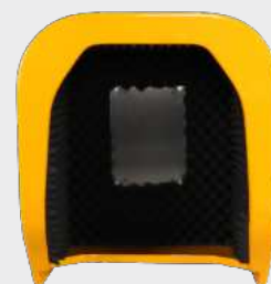
JR-TH-01 Acoustic Hood