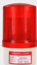
JR-LP-02 LED Beacon Light