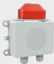
JR-BS-01 Acousto-optical Alarm